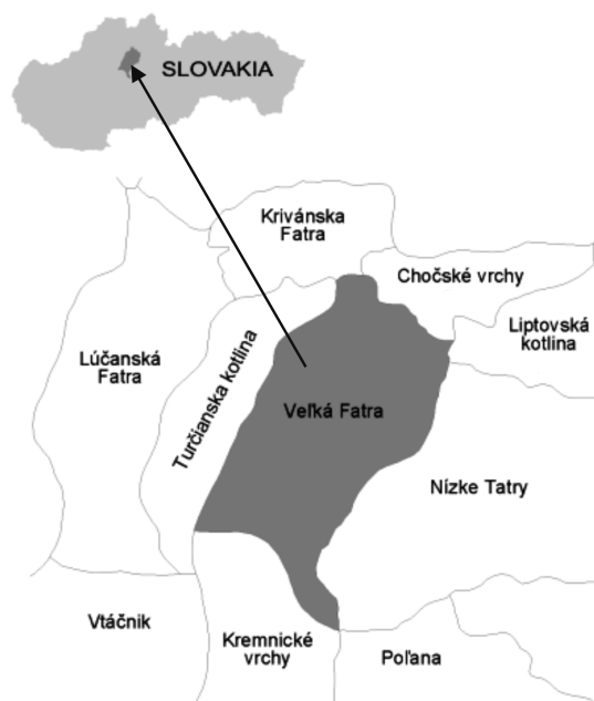
Fig. 1. Location of studied area in Slovakia.

and montane belts of Slovakia, (ii) contribute to a precise syntaxonomy and nomenclature of spring communities in the Western Carpathians, (iii) discuss their classification within higher syntaxa, based on altitudinal gradient or substrate types (cf. Hinterlang 1992; Zechmeister & Mucina 1994; Valachovič 2001), and (iv) discuss the relations between some Central European spring communities (their separateness or identity, incorrect application of association names, etc.).