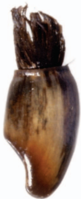
Fig. 5. Cornflower fruit retrieved from a late medieval site near Leiden (Netherlands). Actual length 3.9 mm.

The conclusion must be that cornflower became an important weed not earlier than the High Middle Ages.