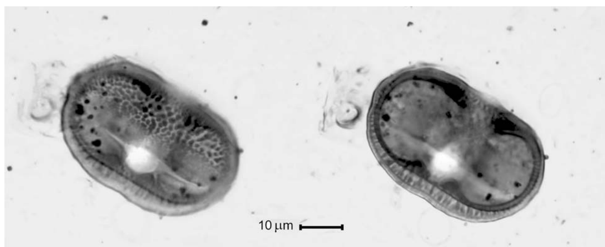
Fig. 3. Cornflower pollen found in a cesspit, same grain, different focus.

Plaggen soils are very common in the southern, central and eastern parts of the Netherlands, in fact everywhere where the subsoil is sandy. Pollen diagrams show, as may be