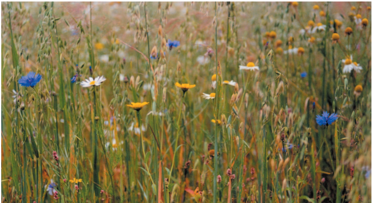
Fig. 1. A colourful cereal field.

were not happy to see this picture and modern methods enabled them to get rid of those unwanted plants. Nowadays cereal weeds can be observed only in special reserves.